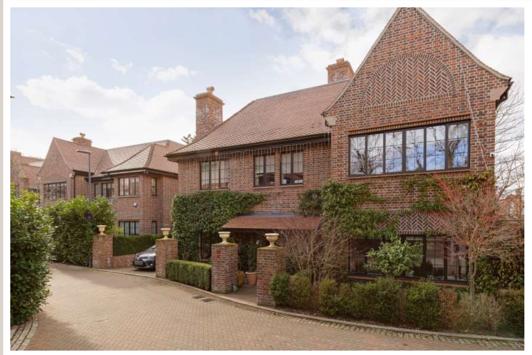
CHANDOS WAY Hampstead Garden Suburb, NW11