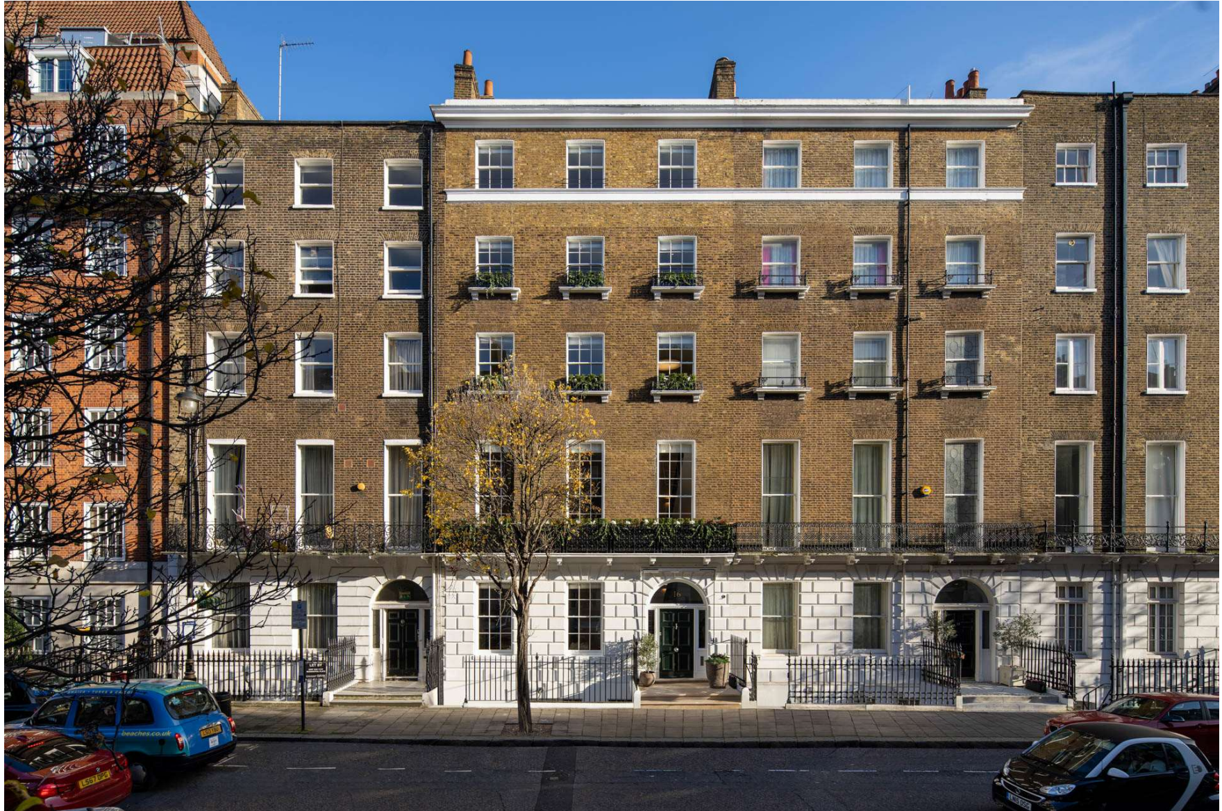
DEVONSHIRE PLACE Marylebone, London, W1G