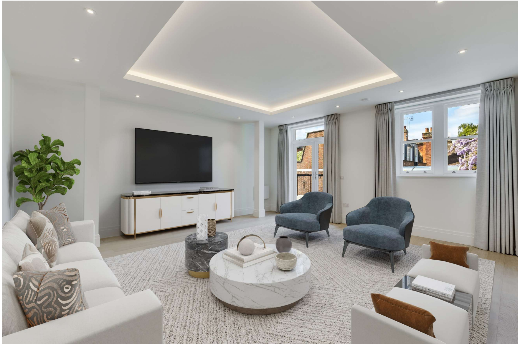
AVENUE ROAD St Johns Wood, NW8