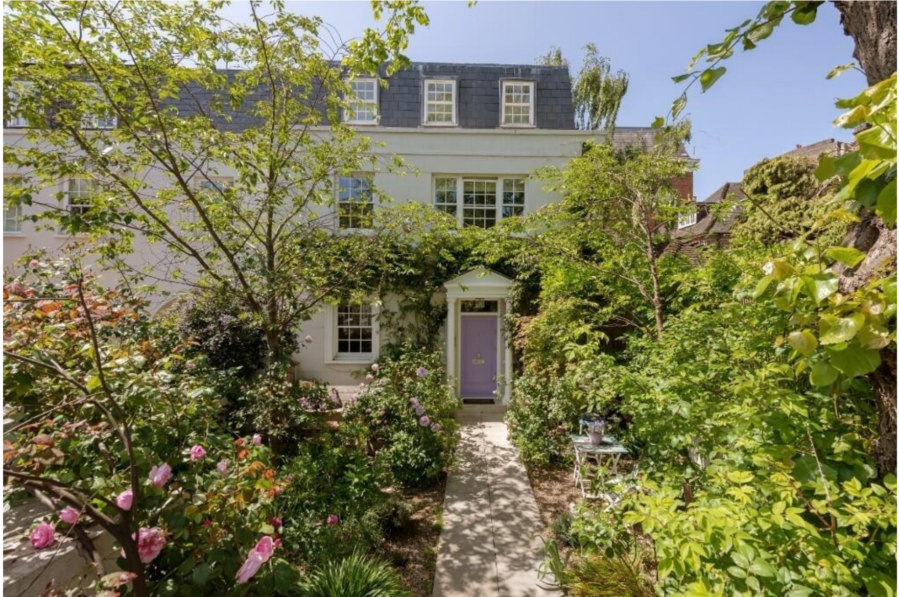
ELM TREE ROAD St John's Wood, NW8