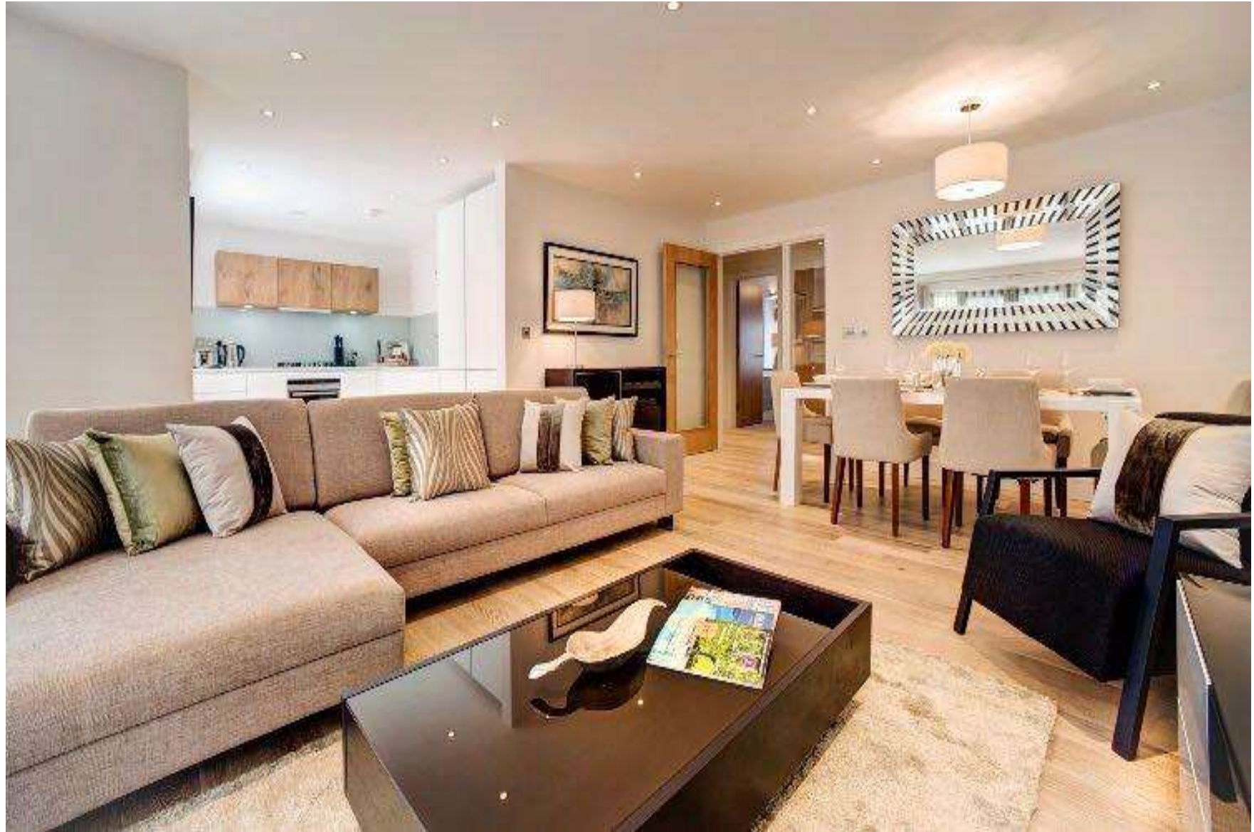
OCTAVIAN HOUSE Alexandra Road, NW8