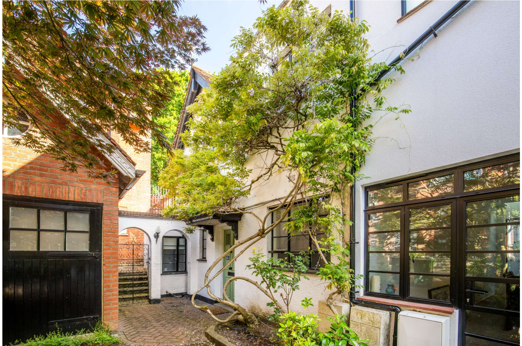
NETHERHALL GARDENS Hampstead, London, NW3