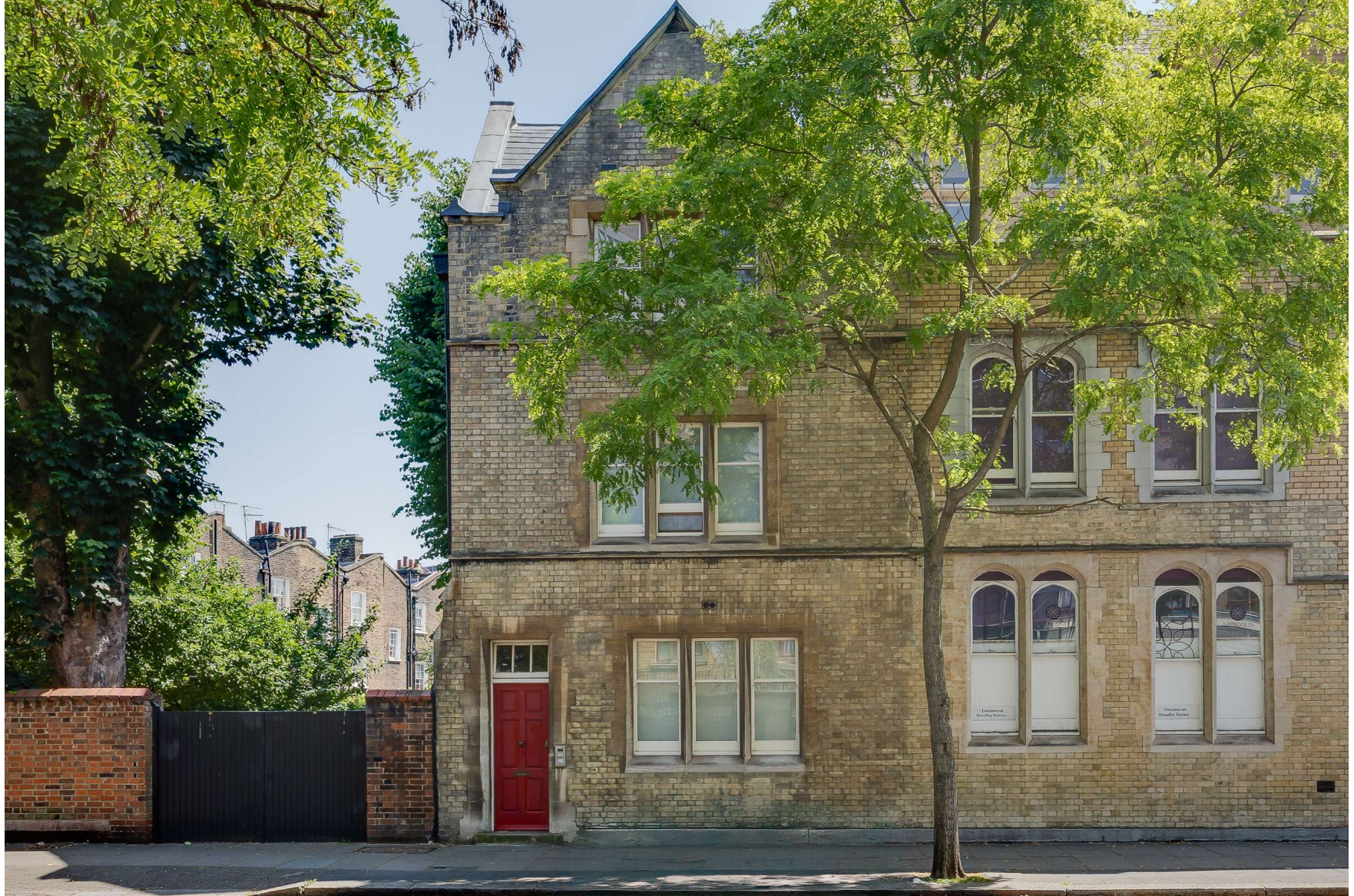
ROSSMORE ROAD Marylebone, NW1