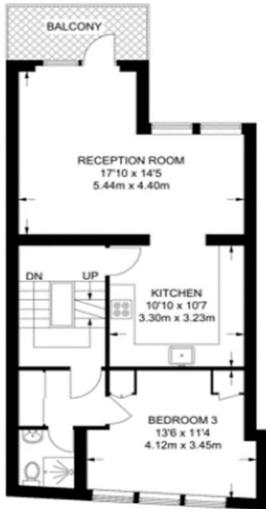
Entry level – second floor